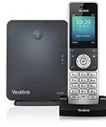
Yealink DECT Cordless